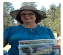
WORLD MUSIC FESTIVAL