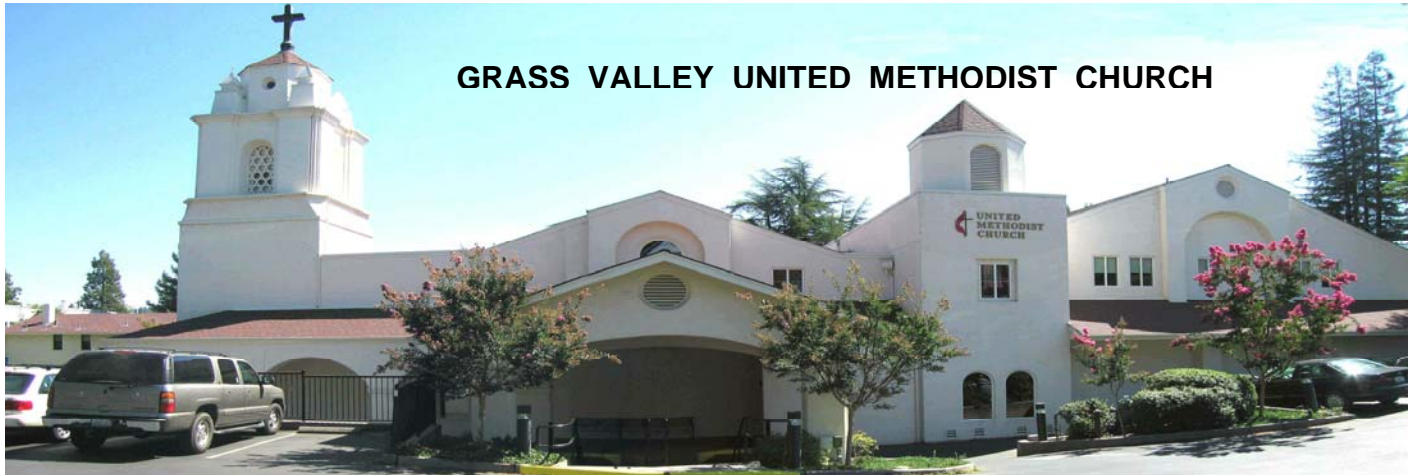
GRASS VALLEY UNITED METHODIST CHURCH