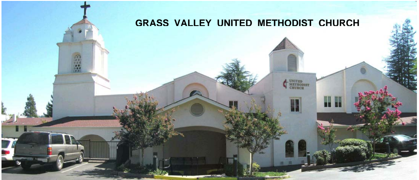
GRASS VALLEY UNITED METHODIST CHURCH